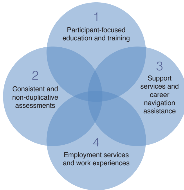
Figure 2: Four Essential Functions of Career Pathways and Programs

The four essential functions of career pathways—and any programs linked and aligned within the pathway—include: