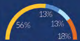
Students who earned a certificate

▲ Two thirds of students who drop out stop at remedial math.