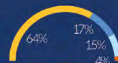
Students who dropped out

▲ A quarter of students take transferable non-algebra courses like statistics